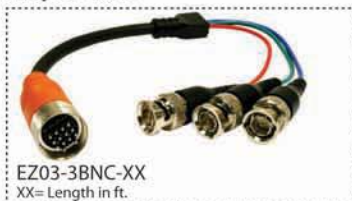
Din14 Male to 3 BNC Male Adapter Cable