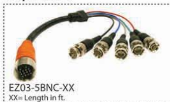
Din14 Male to 5BNC Male Adapter Cable