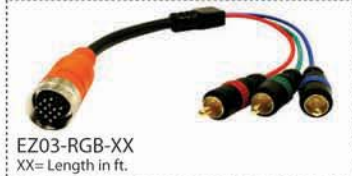
Din14 Male to 3 RCA Male (RGB) Adapter Cable