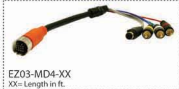
Din14 Male to 3 RCA + MDIN4 Adapter Cable