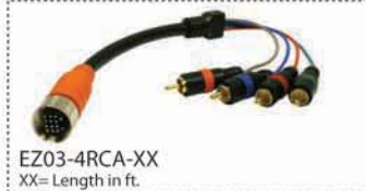
Din14 Male to 4 RCA Male Adapter Cable