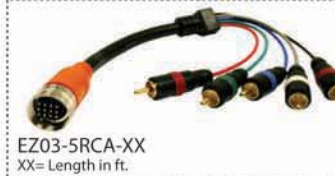
Din14 Male to 5 RCA Male Adapter Cable