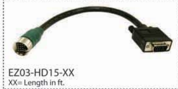
Din14 Male to HD DB15 Male Adapter Cable