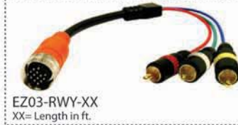
Din14 Male to 3 RCA Male (RWY) Adapter Cable