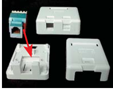
(Keystone jack not included)